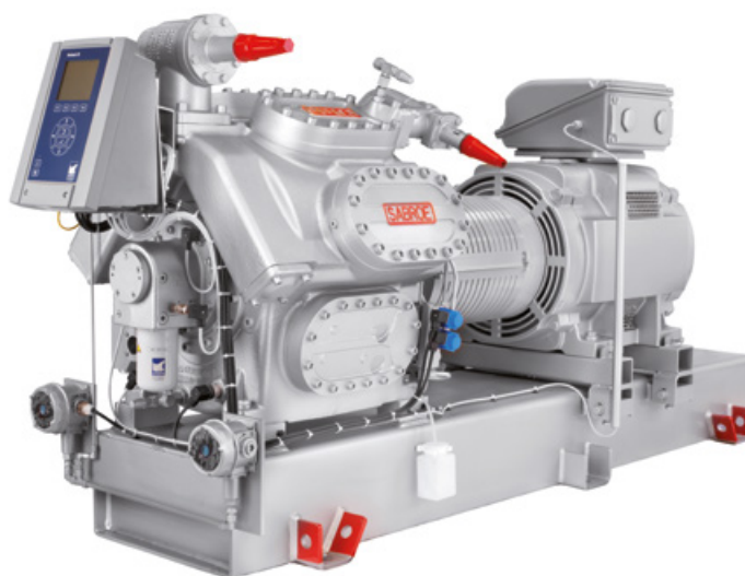
HPC 108 single-stage reciprocating compressor unit (50 bar) with UniSAB systems controller

Sabroe high-pressure compressors provide exceptional reliability and big savings on operating costs, because they are based on the high-volume CMO and SMC compressors, and they share the majority of castings and parts. Our three-year warranty covers the complete unit, including compressor block, UniSAB, motor and coupling – for all refrigerants.